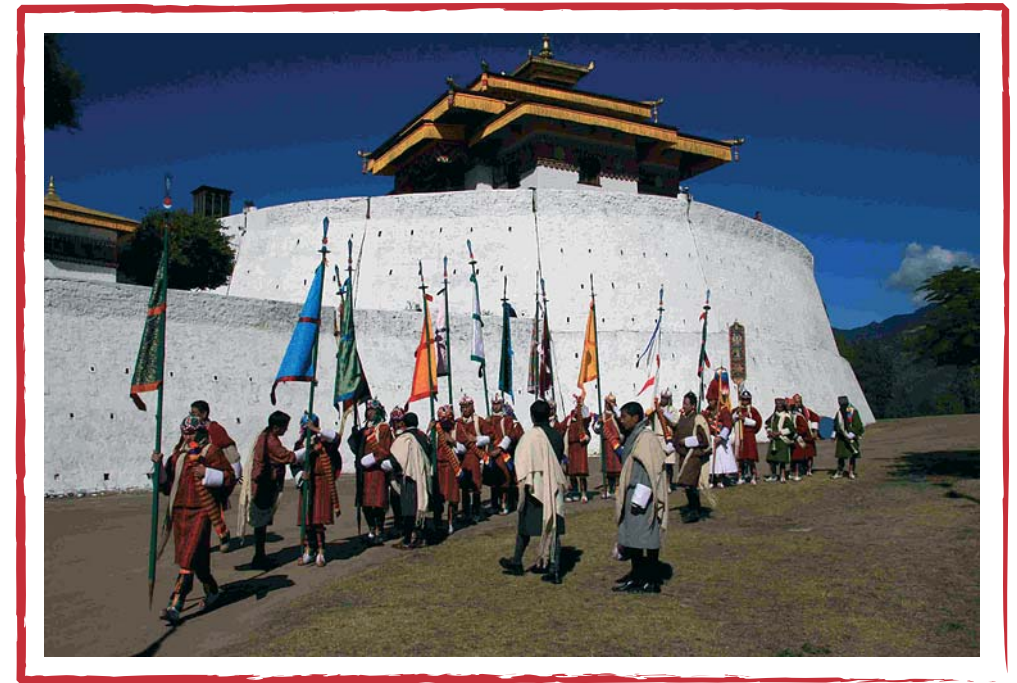
Part of the procession

The next morning, November 1., HM the King, preceded by the “Chipdrel”, enters the Dzong for His spiritual coronation. This profound and poignant ceremony invariably has been held in the Puankha Dzong, in the “Machhen Lhakang”, the secret temple where Shabdrung Ngawang Namgyal, embalmed, is laying in-state and venerated as a living god. This temple is so sacred that normally only 3 personalities are allowed to enter: HM the King, His Holiness Je Khenpo and H. Eminence, the Machhen Zimpon, Chamberlain of the embalmed Shabdrung. At the coronation of HM the 5th King, HM the 4th King is also present.