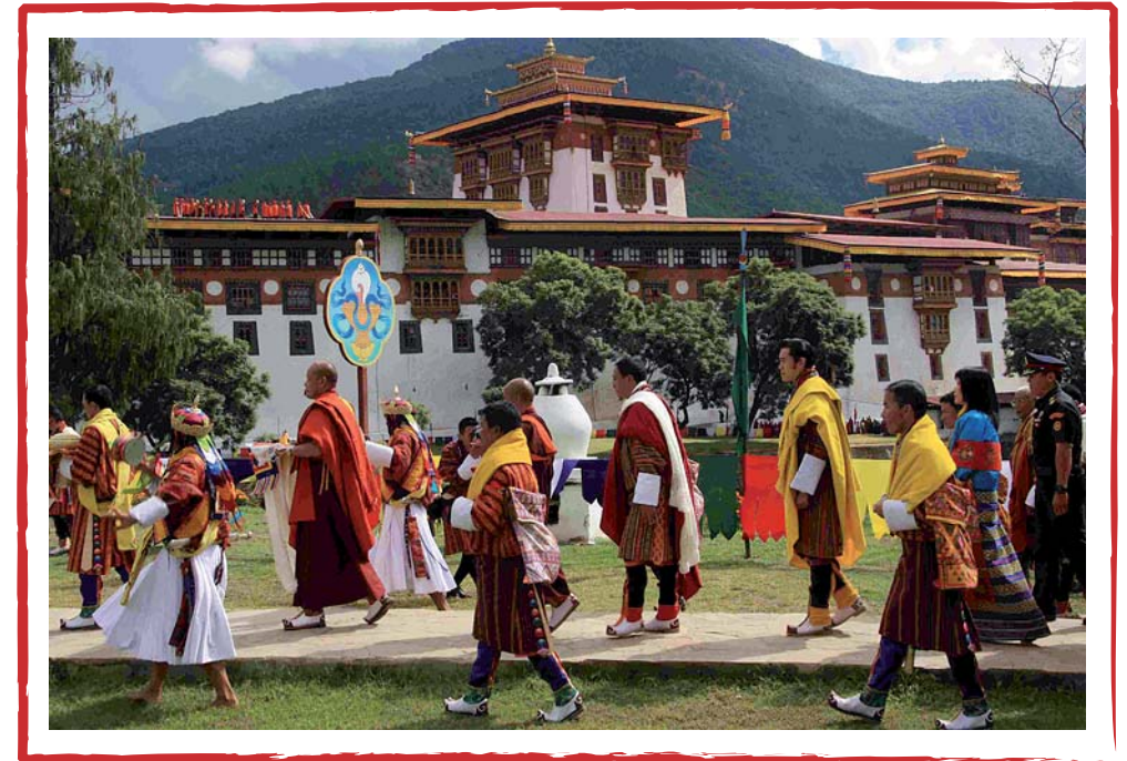
H.M. the new King (long saffron scarf) approaches the bridge to the Dzong

After this sacred ceremony, HM the King, HM the 4th King and HH the Je Khenpo proceed to the near “Kuenra”, the splendid, dome-like, in its beauty overwhelming main prayer hall of the Dzong. HM the King ascends the Ceremonial “Zhug-tri (golden Throne). H.M. the 4th King and HH Je Khenpo take their seats at their “Zhug-tris” (thrones) right and left of the Ceremonial Throne. Follow the “Zhug-drel Phuensum Tshogpi Tendrey” (celebration of harmonious fruition) with serving ceremonial tea. Then the “Marchhang” welcome ceremony offered by 3 high ranking officials and one Lopen ( very high lama). Now His Majesty receives the 6 symbols of “Mendrey” (Mandala), “Ku” (body), “Soong” (speech), “Thuk” (mind), “Yonten” (qualities), “Thrinley” (deeds).