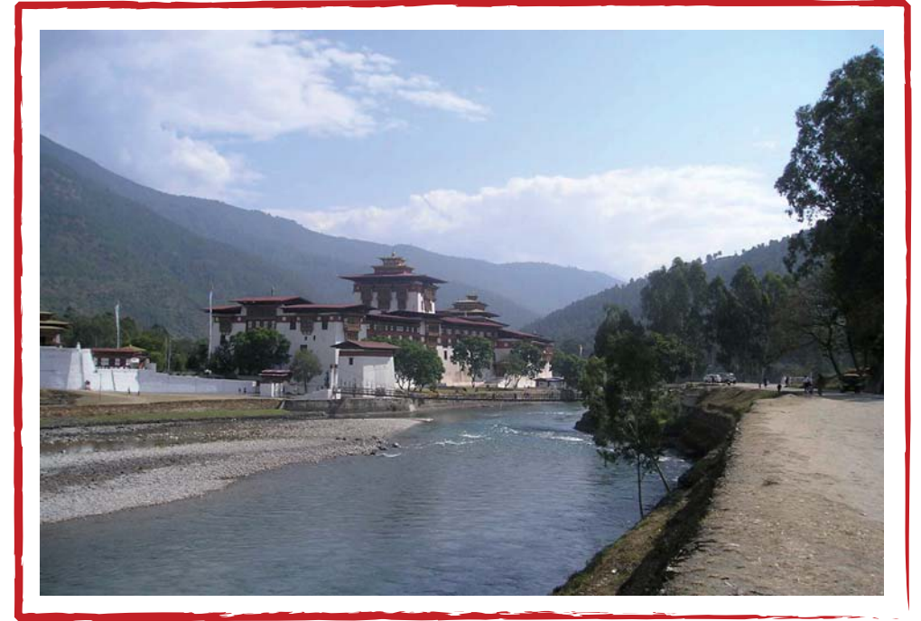
Punakha Dzong with steel suspension bridge, ungainly provisional solution 1958-2007

the many religious processions or the moving of the cortege of His Holiness the Je Khenpo into the Dzong when He takes possession of His winter residence with His 500 monks.