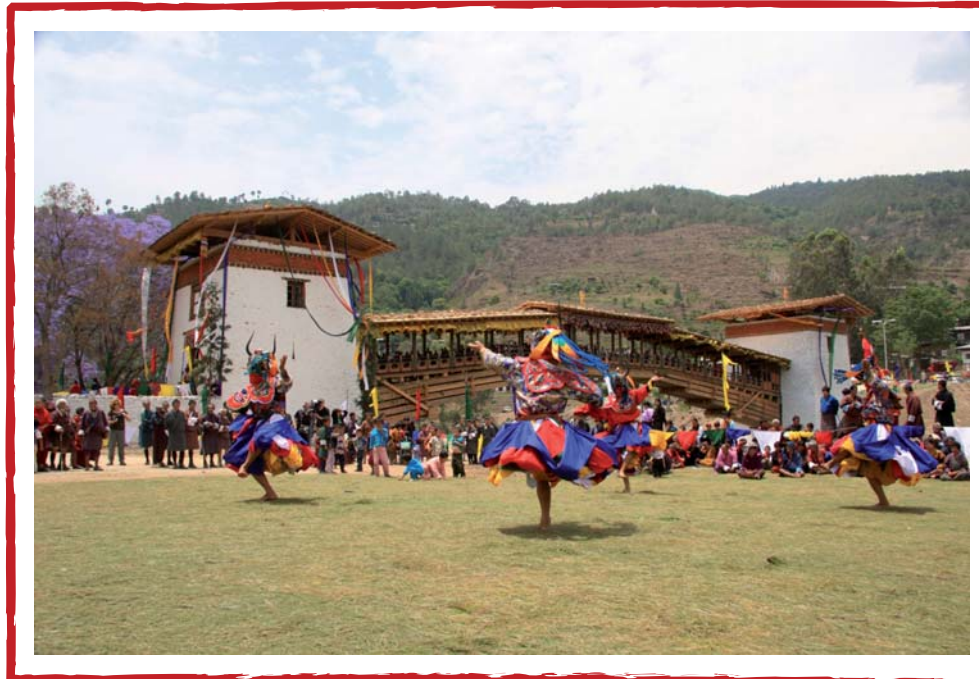
Mask dancers at inauguration 10th May 2008

The new Cantilever Bridge of Punakha in the Kingdom of Bhutan the unique project of "Pro Bhutan, Germany" to marry medieval Bhutanese bridge architecture with modern technology