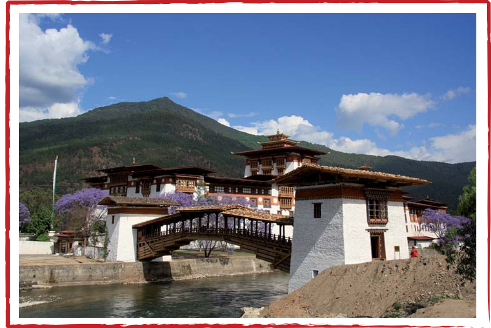
New bridge seen from Punakha village, 10. May 2008